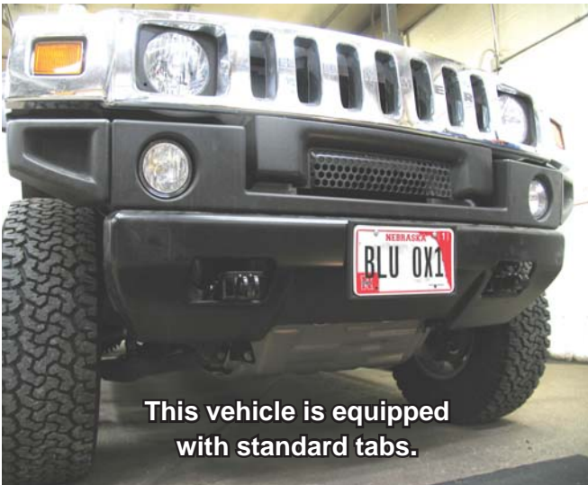
This vehicle is equipped with standard tabs.

DEALER or INSTALLER: Be certain the user receives ALL technical documentation for their products.