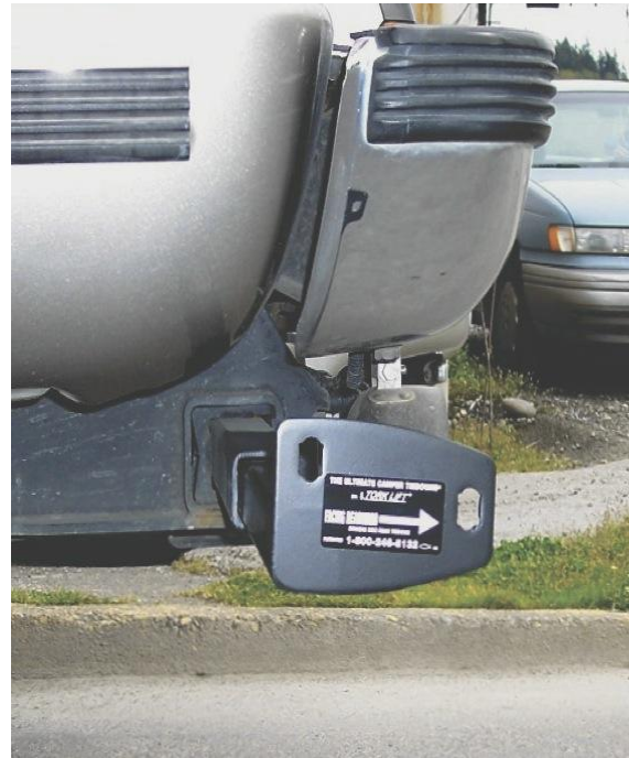
DRIVERS SIDE FRONT DRIVERS SIDE REAR

Once installed, attach the TorkLift directional stickers to the face of the bullet plate on the insert as a reminder.