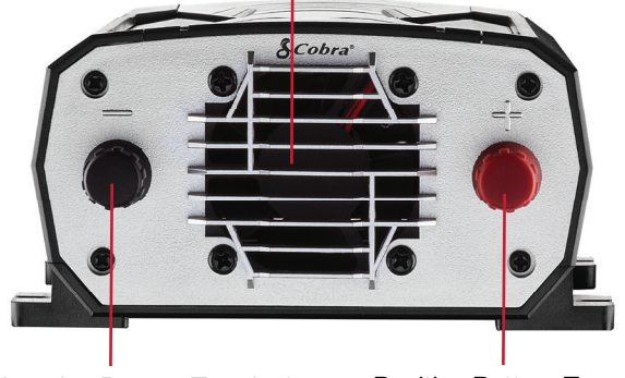
Negative Battery Terminal Positive Battery Terminal