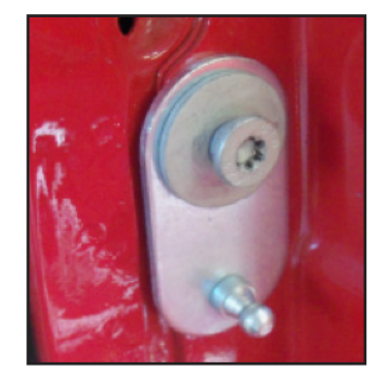
Tighten the bolt with the T50.