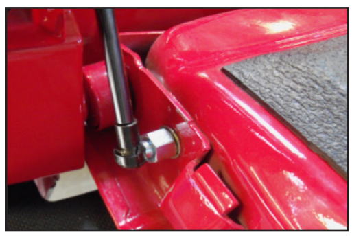
Periodically check the upper and lower mounting locations to insure that parts have not loosened through repeated use. If either mounting location is found to be loose, re-tighten the hardware as needed.