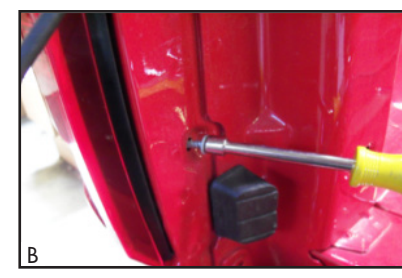
After removing the rubber block reinstall the taillight.

Inside the taillight opening, use an 11mm socket to remove the 2 nuts holding the rubber block in place.