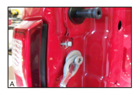
There will still be 2 clips holding the tail light in place. pull the tail light towards the rear of the vehicle to remove it.

Using a 8mm wrench/socket, remove the 2 bolts holding the taillight in place.