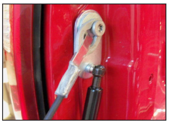
Install the narrow end of the shock on the ball mount.

Install the cable back onto the cable bolt, and the larger part of the shock on the ball mount plate.