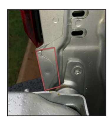
The vehicle shown is an example of how the mylar can be installed. Your vehicle may differ from the vehicle shown.

A Mylar sheet has been provided to help prevent components from rubbing against the truck bed and tailgate in the event that any part becomes loose. Using scissors, cut the mylar to the size needed. Apply the mylar to the truck bed and tailgate where tailgate assist components will be in close proximity during opening/closing. The red lines show the area where the mylar has been installed.