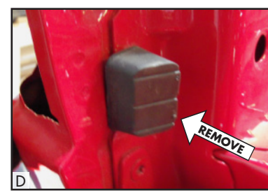
WARNING: If the rubber block is not removed, it will interfere with the shock.