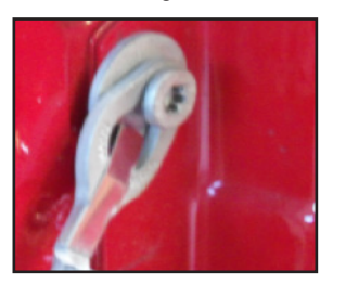
Use a T50 torx socket or the wrench provided to remove the cable bolt.

Remove the tailgate cable from the bolt.