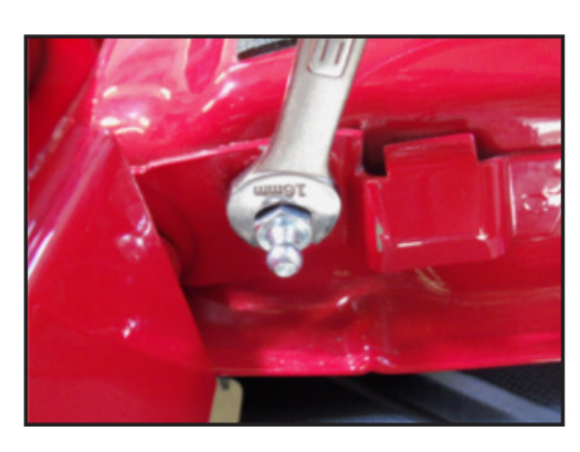
Using a torque wrench to install the ball mount will also insure that the blind nut has been completely installed.

Remove the nutsert tool when installation is complete. nutsert using a 16mm wrench/socket. Torque to 12 ft-lbs with 16mm deepwell socket.