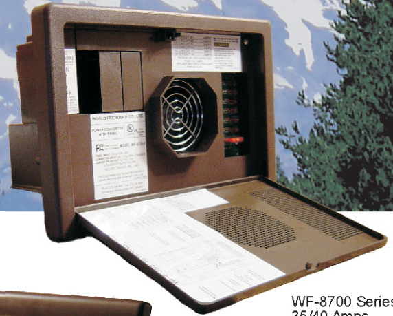
WF-8700 Series 35/40 Amps