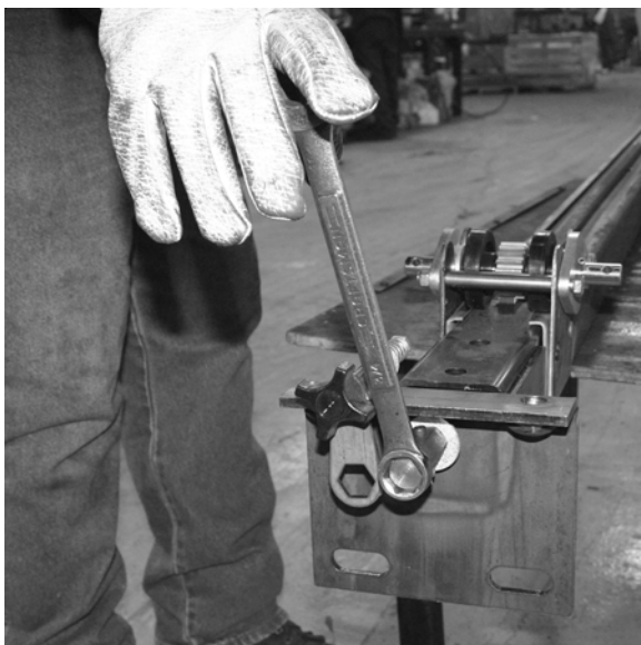
3. Using ONLY a Manual Drive Crank Handle or Manual 3/4" Box End, Open End or Crescent Wrench. Adjust slide mechanism to desired location. Rotate Hex Drive Nut clockwise to move slide mechanism OUT and counterclockwise to move IN.