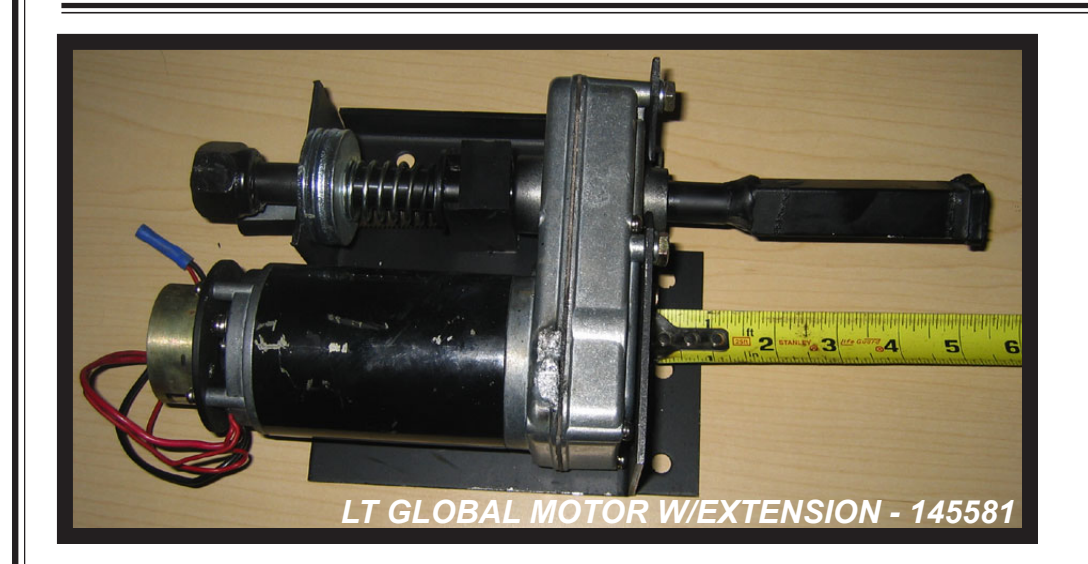
Drive shaft length - 5"