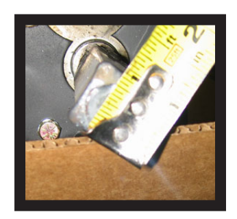
Square Nut on Drive Shaft End - 1"