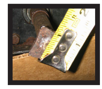
Square Nut on Drive Shaft End - 1"