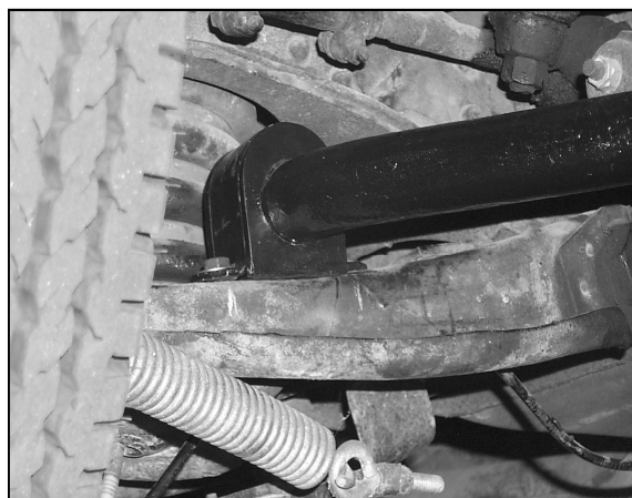
LOWER CONTROL ARM MOUNTING BOTH DRIVER & PASSNGER SIDE