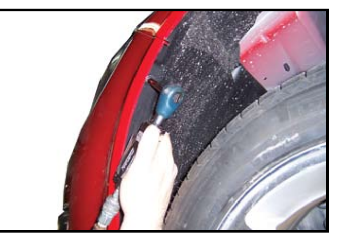
2. Remove three screws from each wheel well.