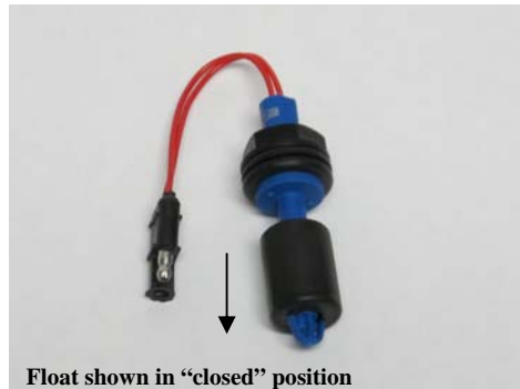
Float shown in "closed" position

Part #1510000030: Black Float with Trailer connector (For plastic tanks)