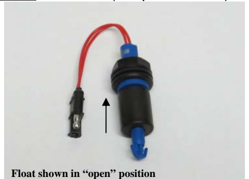
Float shown in "open" position

Part #1510000070: Black Float with Packard connector (For plastic tanks)