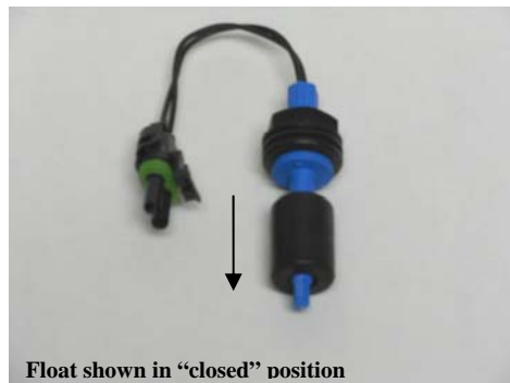
Float shown in "closed" position

Part #1510000070: Black Float with Packard connector (For plastic tanks)