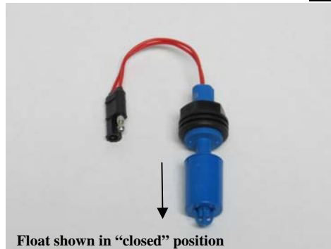
Float shown in "closed" position

Part #140-1146: Blue Float with Trailer connector (For metal tanks)