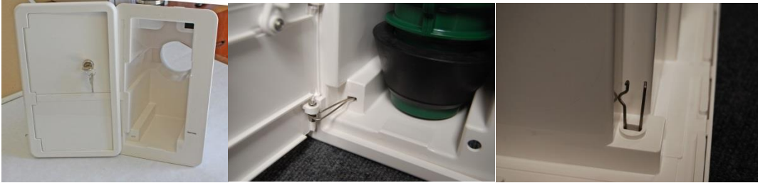
Spring latch inserted into enclosure