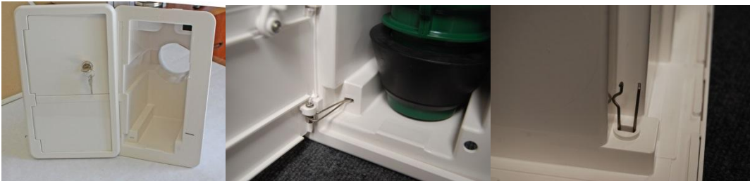
Spring latch inserted into enclosure