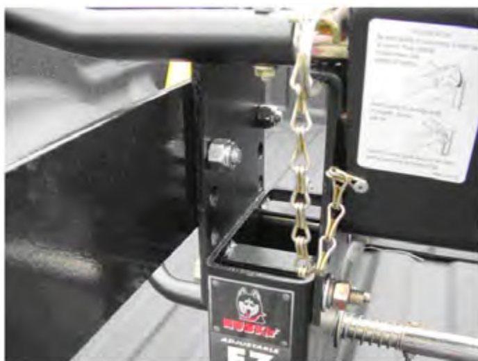
Figure 2- Side Plate Installed