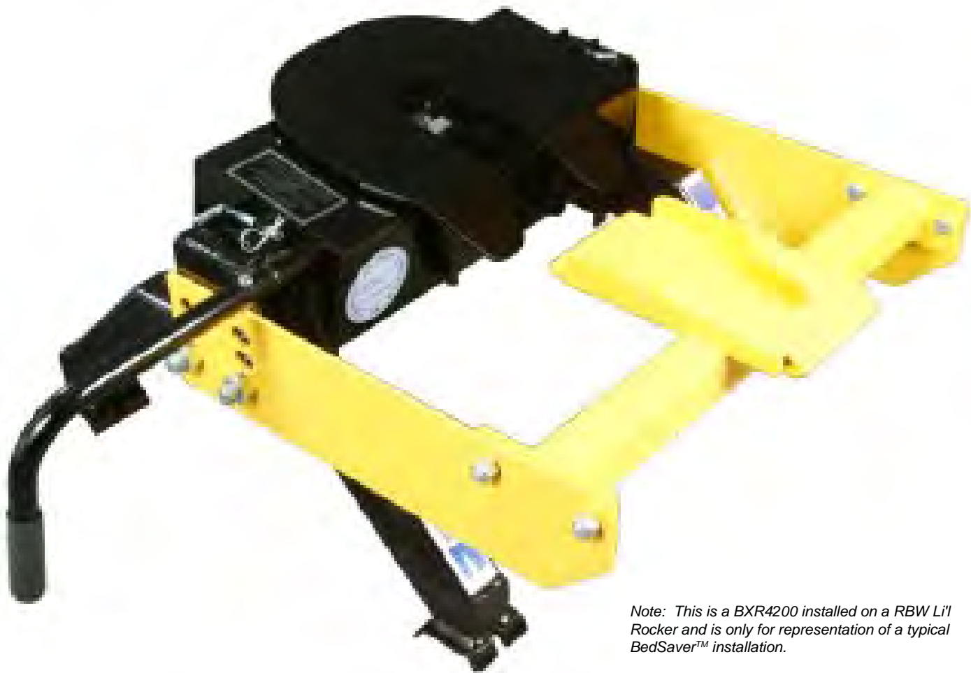
Note: This is a BXR4200 installed on a RBW L'I Rocker and is only for representation of a typical BedSaver™ installation.