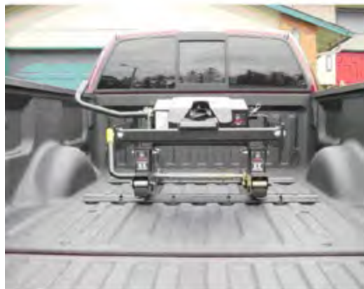
Figure 5-Complete Installation, Rear