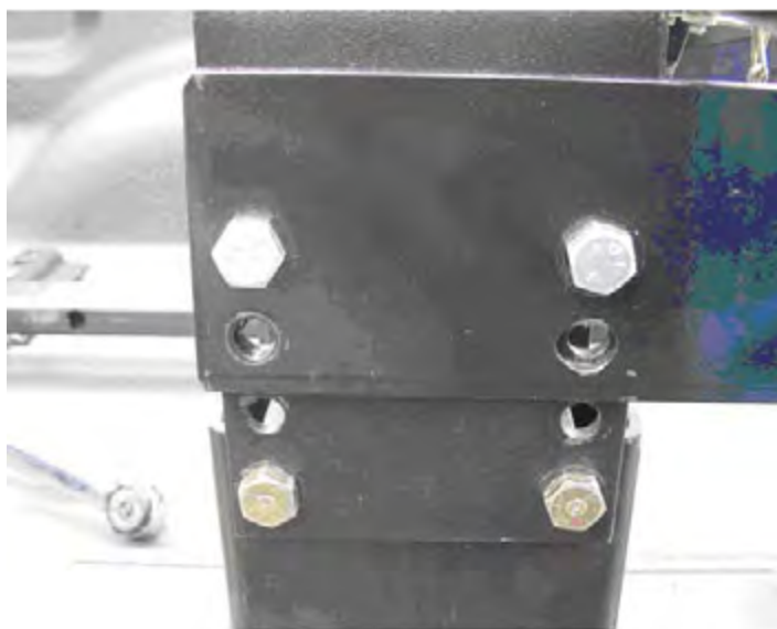
Figure 1- Side Plate Placement