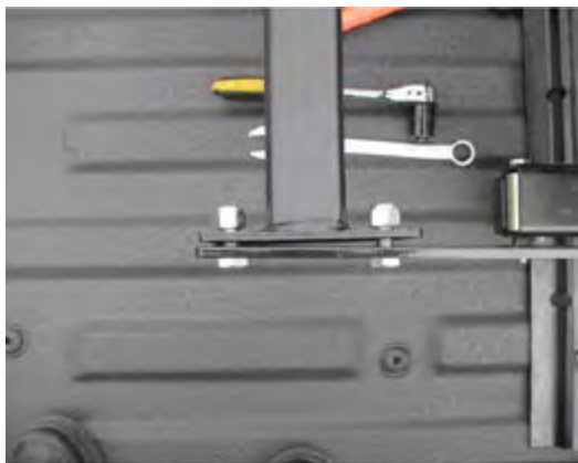
Figure 3-Cross Tube Attachment

NOTE: When tightening the side plates to the hitch frame sides, it may be necessary to lift the side plate for proper alignment and leveling.