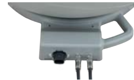
Coax cable connected to sec. port