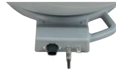
Coax cable connected to main port

The 12 VDC power source or 110 V to 12 VDC converter must meet power supply specifications. See "Parts of the Antenna" for specifications.