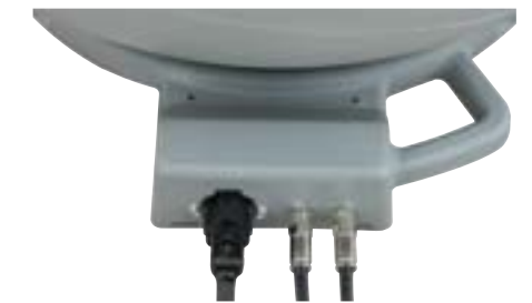
Power cable connected to quick disconnect socket

Make sure one end of the power cable fully connects to the 12 V outlet (or 110 V to 12 VDC converter) and the other end fully connects to the quick disconnect socket of the Anser antenna. You should hear the cable click into place once connected to the quick disconnect socket.