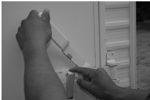
1. Unlock the first Cargo Vise (it doesn't matter what side is opened first).