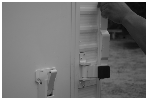
2. Unlatch the Bar Lock and rotate it away from the Cargo Vise.