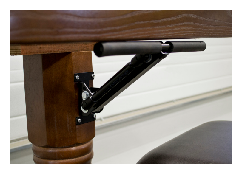
Chair Buddy™ is a patent pending product made by MORryde International, Inc.

for purchasing our Chair Buddy<sup>™</sup> product. We hope you find that it makes your travels easier and safer. Here you will find your qualifiers and installation instructions. If you have any questions give us a call at (574) 293-1581 and we'd be happy to help you out. Also, be sure to check out what other products we offer at www.MORryde.com and if you could "like" and "follow" us while you're there, that'd be great! Thank you.