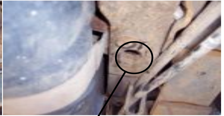
SLOTTED HOLE IN BOTTOM OF FRAME