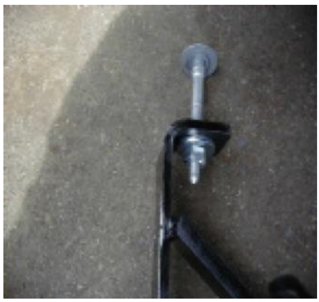
Reuse factory bed to frame bolts