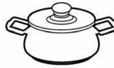
Magnetic Stainless Steel Pot (18/0)