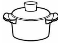
Cast Iron Pot

Cookware should be at least 2.4" wide and have a flat bottom surface.