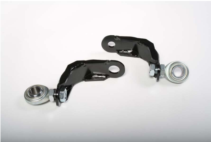
Figure 1: Pitman arm bracket on left, Idler arm bracket on right