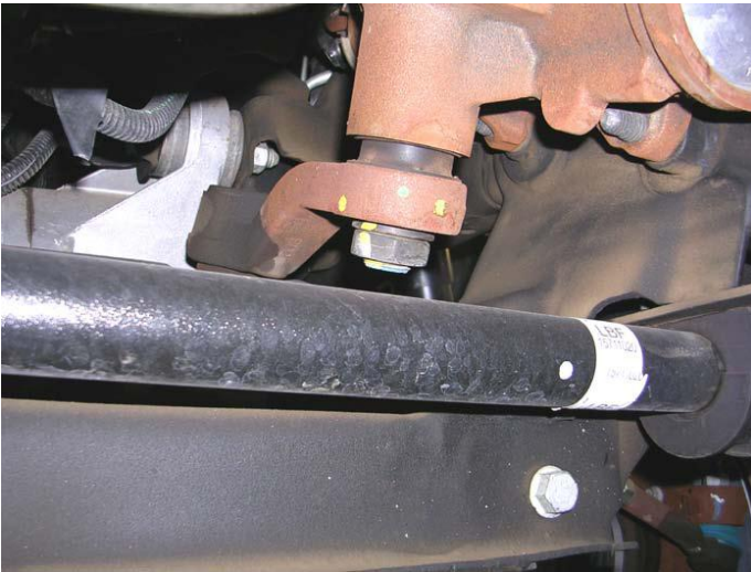
Figure 4: pitman arm