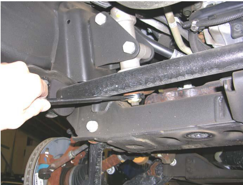
Figure 2: idler arm