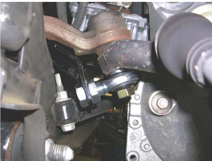
Figure 5: pitman arm bracket installed