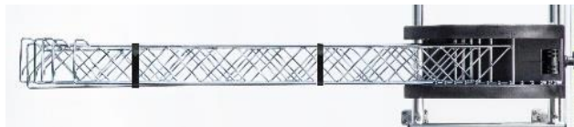
Properly Installed Housing