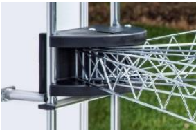
Storage Position Clamshell